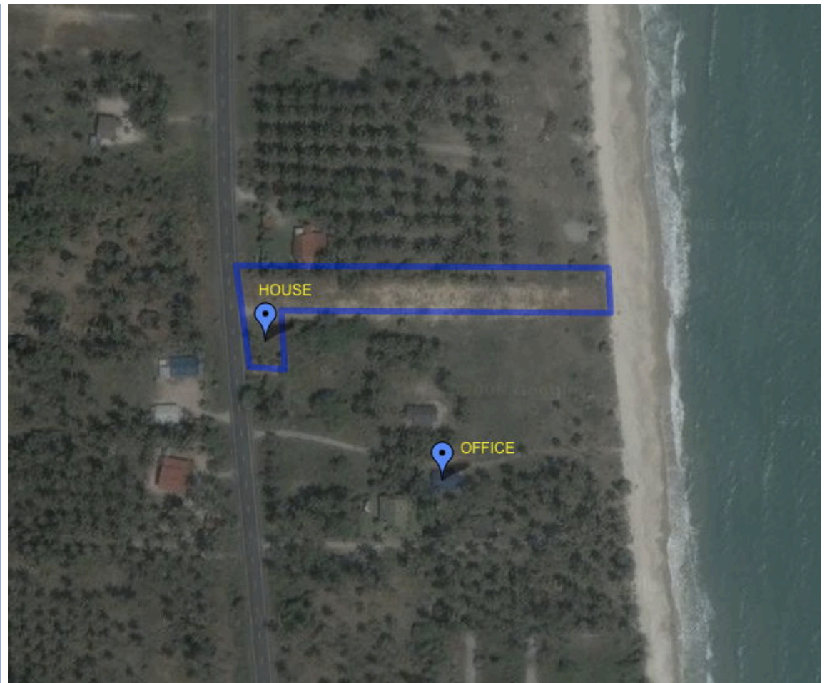
left: greater area